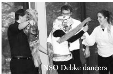
NSO Debke dancers