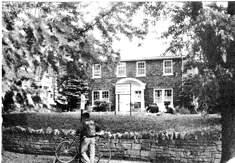
Department Building, Folklore Institute, 1982