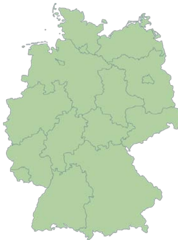
WIKIPEDIA COMMONS Germany has 16 federal states.

qualitative data, that the researchers were not able to examine and give grades based on all curricula in the German educational system, and that the data comes from a very particular point in time. There was demonstrated positive correlation and statistical significance between 2004 youth voter turnout and grades received in Social Studies curricula. The 18-21 year-olds had significance at the .023 level and the 21-25 year-olds had even more significance at the .006 level. This partially confirmed my hypothesis that civic education within a European context will increase youth voter turnout during EP elections.