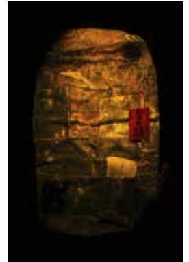
Trace (Dad #437) Dyed cyanoacrylate and fingerprint bonding on crime scene evidence