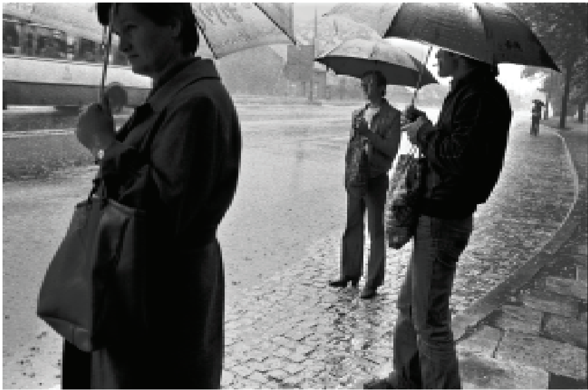
Bus stop in Kraków, 1983