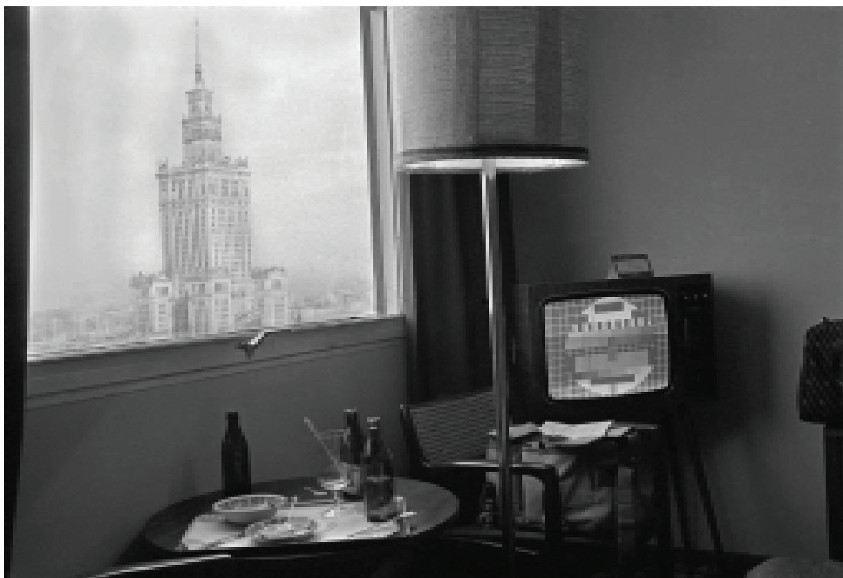
The Palace of Culture as seen from the Forum Hotel, Warsaw, 1988.

solace in the Church, and rising to the challenge of a new economic and political reality. The photographs presented at this show, and those shown on these pages, were published in a book titled Among you Poles (Między Wami Polakami) published by Znak Publishers, Kraków, 1992.