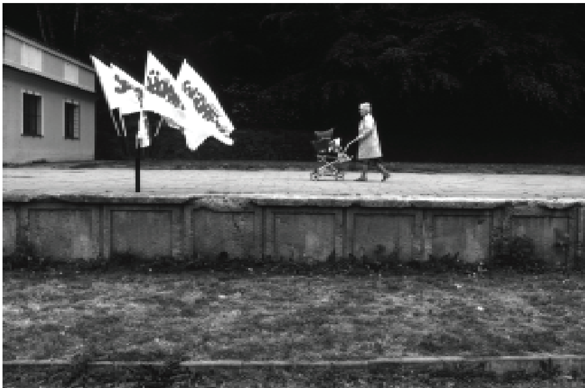
Train platform in Gdynia, 1989.