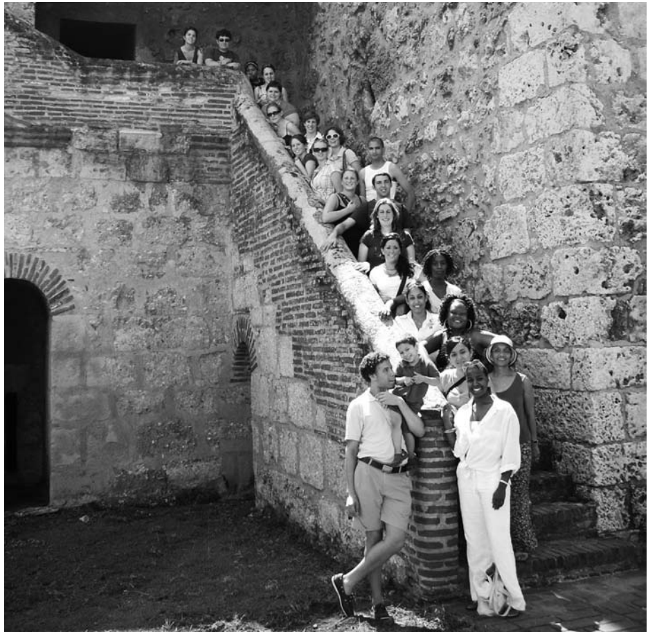
Dominican Identity in the Age of Globalization course participants explore the Fortaleza Ozama, in Santo Domingo's Zona Colonial, during their 2007 summer abroad.

For more about study abroad options, visit www.indiana.edu/~overseas .