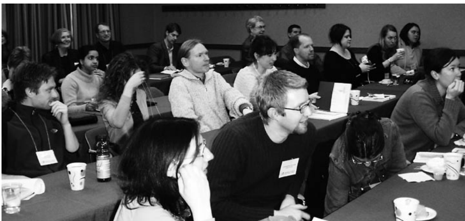
One of the sessions in progress.