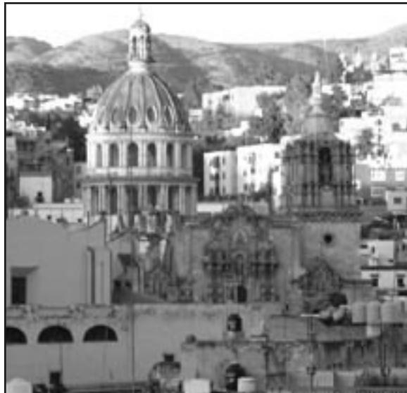
Cityscape: Guanajuato as seen from a hotel

expected. These campaigns met some of the immediate visual needs of the patients, but there was an obvious ongoing issue of referral and follow-up that made some of the diagnostic testing of questionable importance.