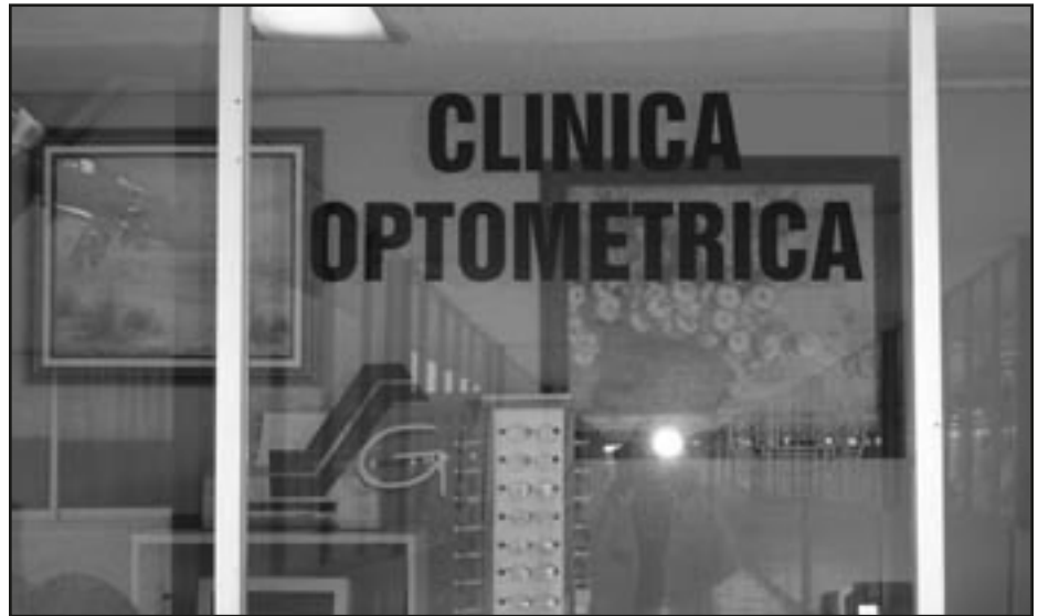
The Guanajuato Optometry Clinic has an array of patient services to offer.

The annual campaigns consist of approximately 35 IUSO students and another nine participants from the alumni and faculty. During these trips, typically about 3,000 patients are seen. The exams consist of history, acuities, autorefractometry, preliminaries, and direct ophthalmoscopy. Additional testing with slit-lamp, BIO, or additional refractive techniques are performed when indicated. Refractive correction is chiefly achieved through dispensing of donated spectacles. The school has a long and strong relationship with the Lions Club recycling center in Upland, Ind. Students over the years have