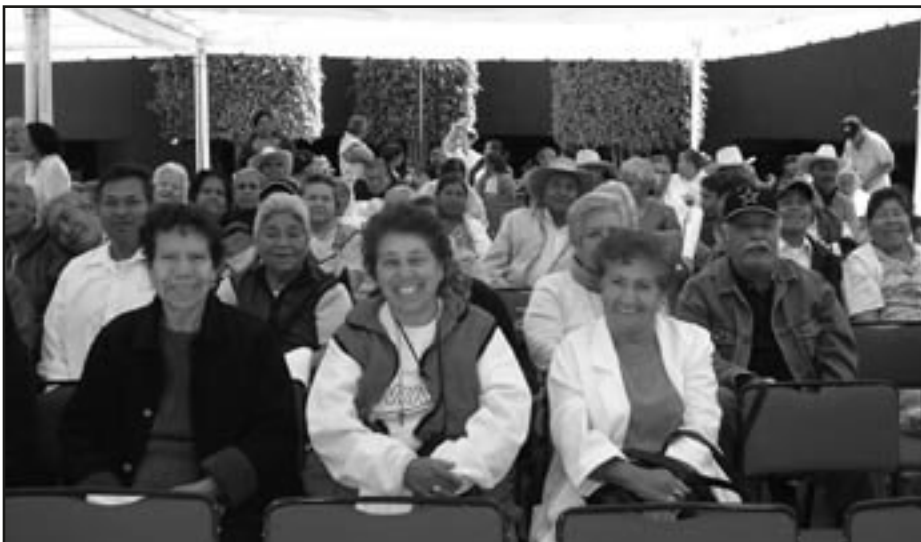
Patients wait patiently beneath a tent to have their eyes checked.

"Guanajuato is a beautiful city, and I love being there," she says. She also enjoys dancing the salsa, which doesn't hurt when living in Mexico.