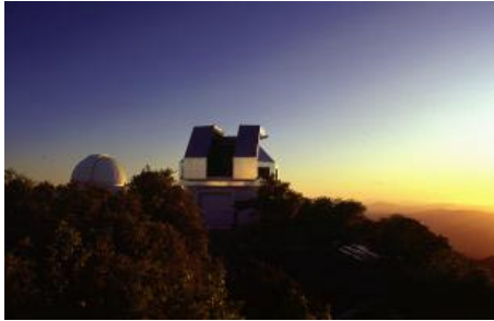
WIYN 3.5-meter Telescope

The WIYN Observatory, consisting of 3.5-meter and 0.9-meter telescopes located at Kitt Peak National Observatory, Tucson, AZ, is operated by the WIYN Consortium, whose members include the University of Wisconsin, Indiana University, Yale University, and the National Optical Astronomy Observatories. The IU Department of Astronomy also operates the Geothe Link Observatory with stations near Mooresville, IN and in Morgan-Monroe State Forest.