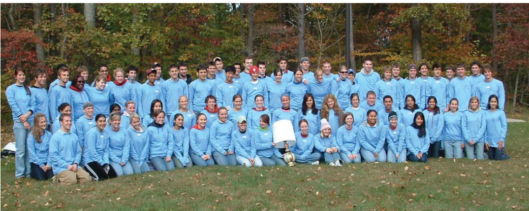
LAMP sophomores enjoyed an all-day retreat in the woods of Brown County last October. It was a day for sophomores to develop team and leadership skills, to make new friends, and to begin the happy process of creating a LAMP community.