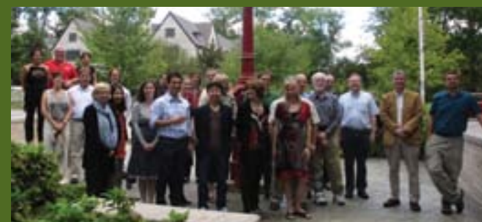
SLIS/SolC Faculty Retreat, Bloomington, 8/17/12

Watch for announcements about the merger. The formal merger of the school is scheduled for July 2013. "Grand Opening" celebrations will be held during the Fall 2013 semester - so that we may share the new school's excitement with the student body during the academic cycle of the university.