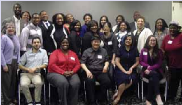
LLID Final Forum 2011