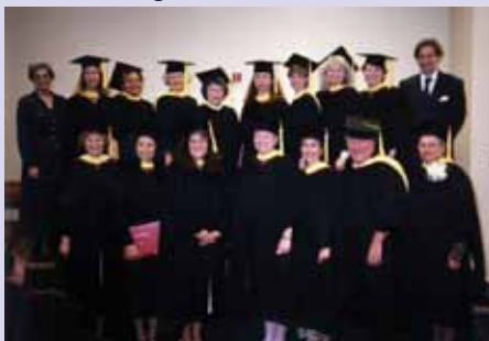
Graduation, SLIS Indianapolis