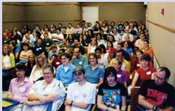
Fall Orientation, SLIS Bloomington