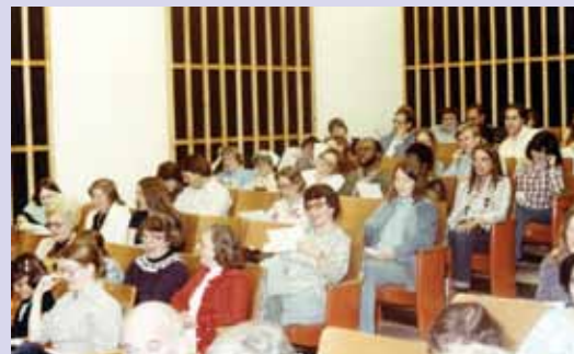
Fall Orientation, Bloomington