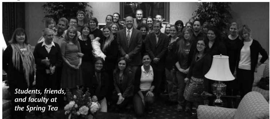
Students, friends, and faculty at the Spring Tea

Nurturing strong connections with other units is extremely valuable, and can only help Slavic to prosper and flourish. It is my expectation that future joint hires may be the norm, rather than the exception. Previous to Emery's, mine — with the Department of Linguistics — was the only such position (and I came to IU in 1987!). Our health, in my view, rests on our interdisciplinarity and versatility, and I can anticipate possible positions shared not just with the departments of Comparative Literature and Linguistics, but with departments such as Folklore, Anthropology, Religious Studies, and Communication and Culture, to name but a few. And while at the moment this issue of DOSLAL goes to press no hiring authorizations have been announced, over the next few years I expect a steady stream of new hires in Slavic, beginning in the fall with a much-needed search for a senior faculty member.