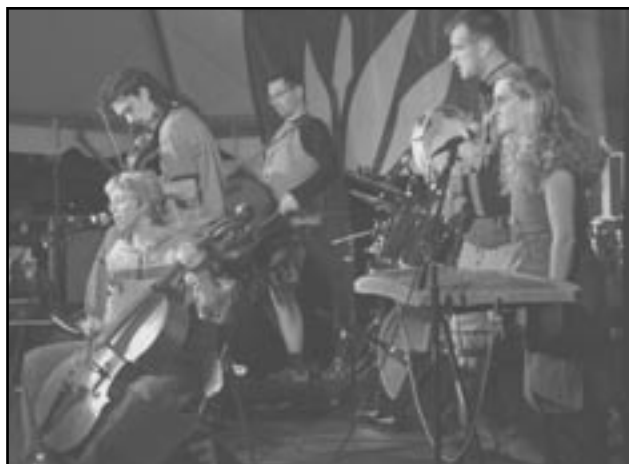
The Warsaw Village Band in Bloomington

Look for their new CD, Uprooting , which was released in October 2004. All of their Lotus Festival fans sincerely hope that they will return to Bloomington very soon. —JBC (The Warsaw Village Band website is at www.wvb.terra.pl )