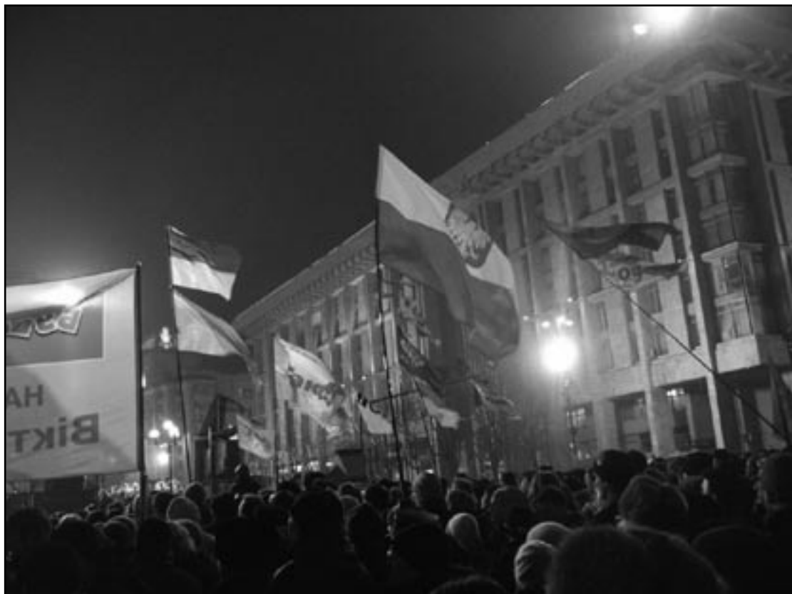
The Polish flag on the streets of Kiev, December 2004, symbolizes Polish support for the Orange Revolution.