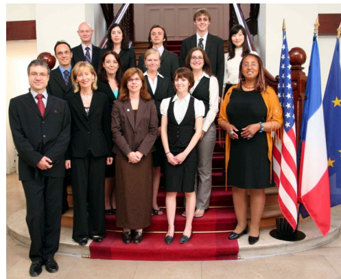
2009 EU in the 21st Century Summer Study Trip participants