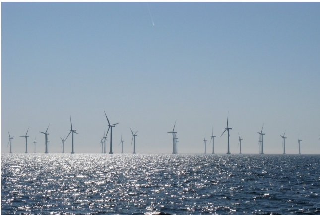
Part of the 2008 off-shore wind farm, Lillgrund, Sweden

that the European Union currently imports 50% of its energy needs; improvements in wind energy technology; reduced costs of wind energy; provision of direct and indirect employment through research and technology development and turbine production. Europe's wind energy industry employed 154,000 people in 2007 and the global market continues to be dominated (more than 60%) by European companies. Vestas, from Denmark, has a 25% market share for wind turbines. All of these combine to make increasing the share of electricity generation from wind an attractive proposition.