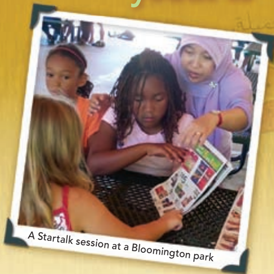
A Startalk session at a Bloomington park

Over the summer in Bloomington, students in community summer programs were surprised and excited about the hands-on activities in the non-traditional language learning courses in which they participated. These activities included making a fresh Middle Eastern salad, shopping in an Egyptian market, exchanging money and studying traditional art and culture. The children had fun while becoming more culturally aware and acquiring new language skills.