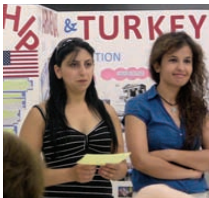
Turkish and Armenian teachers present a project before the group.

The focus was largely on how to help the teachers bring more student-centered learning to their classrooms. All were middle and high school English teachers in either Armenia or Turkey. Embedded in the professional development institute was a goal of allowing educators from countries with a long history of strained relations to learn about each other.