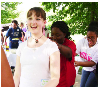
Dancing at the picnic

On July 16, participants in the new Monroe County Community School Corporation's Early College High School program came to the IU School of Education for a kickoff picnic. High school freshmen can take coursework for dual credit at Ivy Tech and Indiana University starting this fall. Students can complete significant degree hours before ever stepping onto a college campus