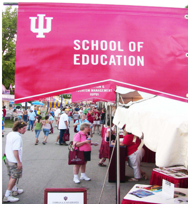
Fairgoers visit IU SOE Booth

This year’s School of Education booth featured the 100th anniversary celebration, including a special giveaway to participants in a quiz about the school’s history and the founding year of 1908. Several alumni stopped by the booth to record in a short video their memories of the School of Education. Quite a range took advantage of that opportunity, including one 1949 graduate, some from the 1960’s, and others from more recent