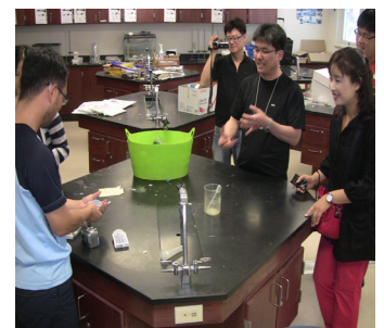
Visiting teachers at BHSS lab

Twenty-two secondary math teachers participated in a four week mathematics education training program at the IU School of Education this summer. It’s the third year the School of Education has won a grant from South Korea’s Seoul Metropolitan Office of Education to host the teachers. It’s part of a program the government in Korea sponsors to send math and science teachers across the United States to learn different methods of teaching.