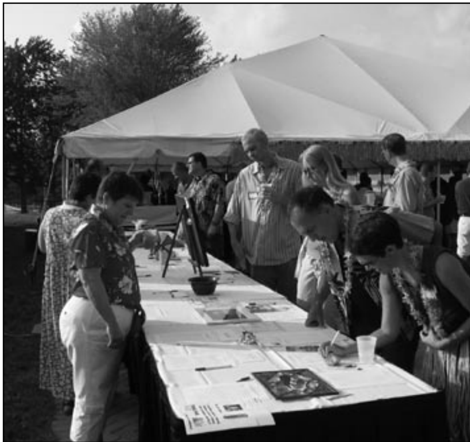
Luau attendees eagerly place bids during the silent auction.

"It was far easier to secure the items than people would have thought. I was a little surprised at the generosity. Some of these people blew me away,