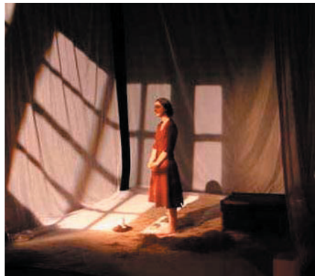
A scene from Juliet