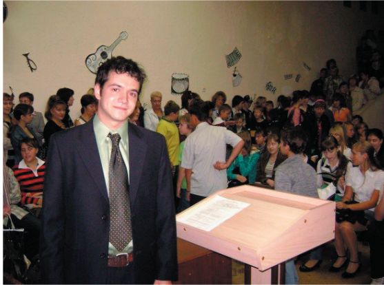
Author at a presentation in Blagoveshchensk

I arrived in Vladivostok on August 25, 2007 to start work for American Councils after undergoing training in Kyiv, Ukraine. My position was that of participant recruiter for the FLEX program (Future Leaders Exchange). FLEX is a federal government program that provides opportunities on