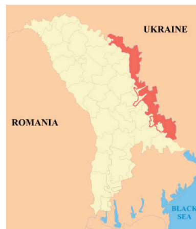
Map of the separatist region and Moldova

Students of conflict and nationalism can rarely avoid entering the linguistic maze that frequently accompanies separatism and political tension. Volumes of debate on federalism are contained within the expressions “the United States is ” and “the United States are .” The choice of Latin or Cyrillic alphabet conveyed information about actors in the countries of the former Yugoslavia. Speakers of Russian understand the significance of the prepositional complement of “Ukraine,” just as speakers of English understand the contentious distinction between “Ukraine” and “the Ukraine.” Few conflicts are as troublesome to the Western analyst as the frozen conflict in Moldova, where a largely Russophone population on a sliver of land between the Dniester river and Ukraine has enjoyed de facto autonomy since 1991. Since the 1992 ceasefire that ended armed hostilities, authorities in Chisinau and Tiraspol (the capital city of the separatist region) have engaged in a war of words. The rhetorical battle has complicated the task of the disinterested observer, who risks being drawn into one side of the political battle through careless use of language.