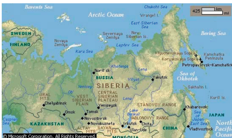
Map of Siberia

Seeing how people preserved their humanity in unbearable conditions is where life histories offer something that simple historiography cannot. Each life history has within it many different ways that deportees remained sane in the harshest of environments. Deportees had to make a concerted effort to stave off depression – some learned new skills, such as how to catch birds for extra food, while others cared for the indigent or even adopted orphaned deportee children. The authors of these narratives recall day-to-day events that kept them from giving up hope, and some even recall day-to-day humor. For example, a Lithuanian woman recalls how she and a friend comically smuggled ice-cold fish back to their camp by stuffing them down their pant-legs.