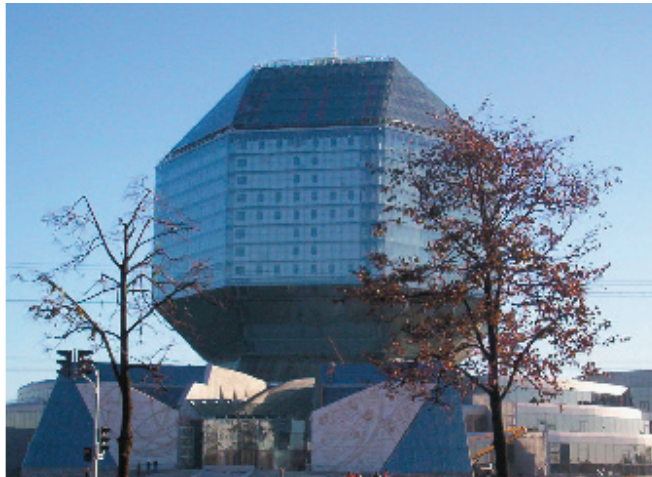
Library Minsk.

Anyone with an interest in Eastern Europe or the former Soviet Union or a desire to learn about a fascinating country is welcome to join the Belarusian Studies Organization. The first activity of the organization was a film showing of Ploshcha on November 13 th . This