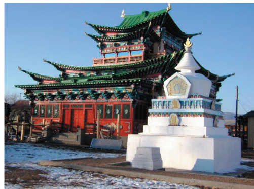
One of the temples in the Datsun, the largest Buddhist monastery in Russia

The program is, foremost, a cultural exchange rather than merely a year of free English lessons. The students have to be flexible because they cannot choose the family with whom they will live, the city or state in which they will reside, the school they will attend, or even the grade in which they will study. The popularity of this competition has waned in recent years in Russia, as some parents choose to finance their children's participation