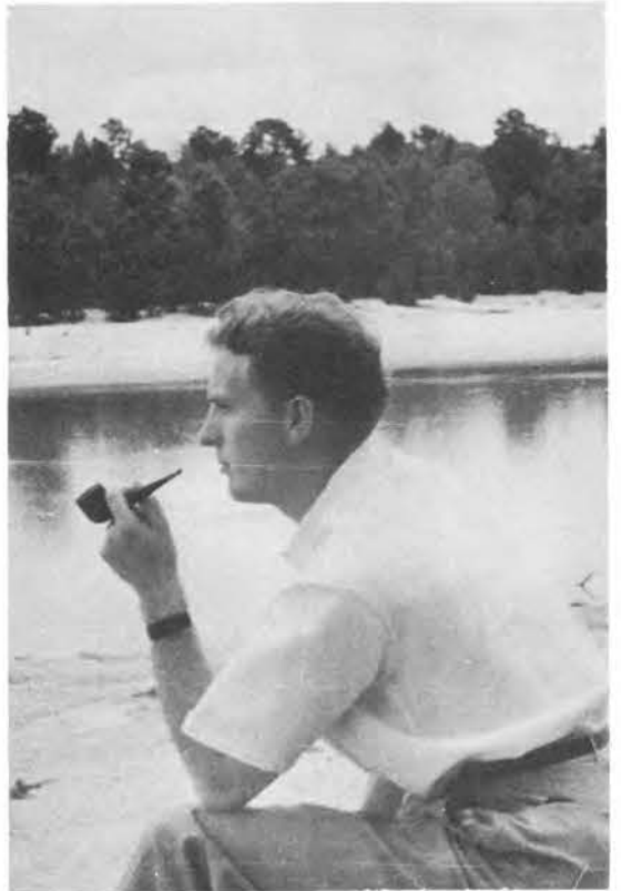
Handsome, isn't he? San Jacinto River, May 1941