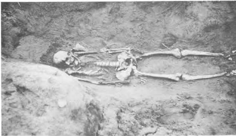
Results of the above digging - Baker-Lowe Mound.