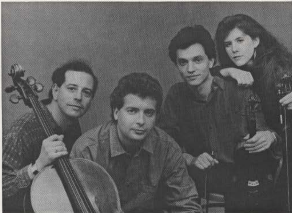
The Chester String Quartet

One of America's most distinguished and sought after chamber ensembles, the Chester String Quartet has been called "one of the best and brightest of the country's young string quartets" by the Boston Globe . Their engaging style and deep sense of musical commitment have brought them rave reviews from audiences and critics throughout the United States, as well as Latin America and Europe. The Chester's interpretations have also led to top prizes at international quartet competitions in Munich, Germany, Portsmouth, England, and Chicago's Discovery Competition.