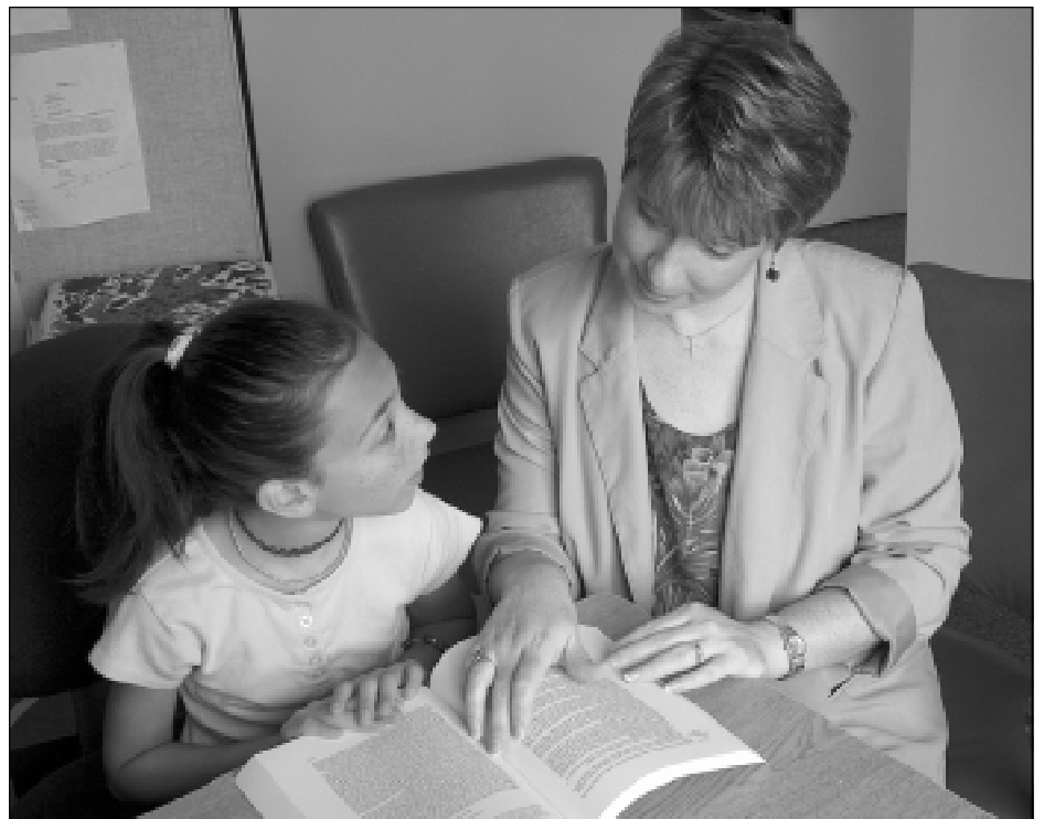
Paraprofessionals can earn an IU associate of arts in general studies to make sure "no child is left behind."

For more information, call (800) 334-1011.