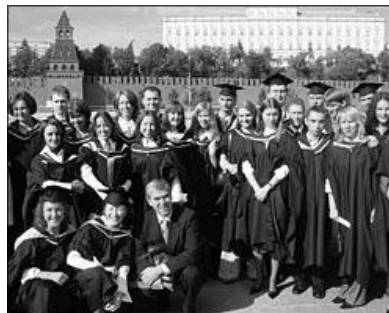
Students and faculty from the State University Higher School of Economics gather near Moscow's Kremlin

At the same time that IU and REEI are building institutional relations with the HSE, the School of Public & Environmental Affairs is also moving forward with a joint project with the School. The Institute of Family and Social Responsibility was awarded a $290,000