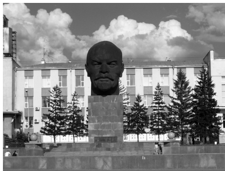
The largest Lenin head in the world sits in front of the National Archives of the Republic of Buriatia