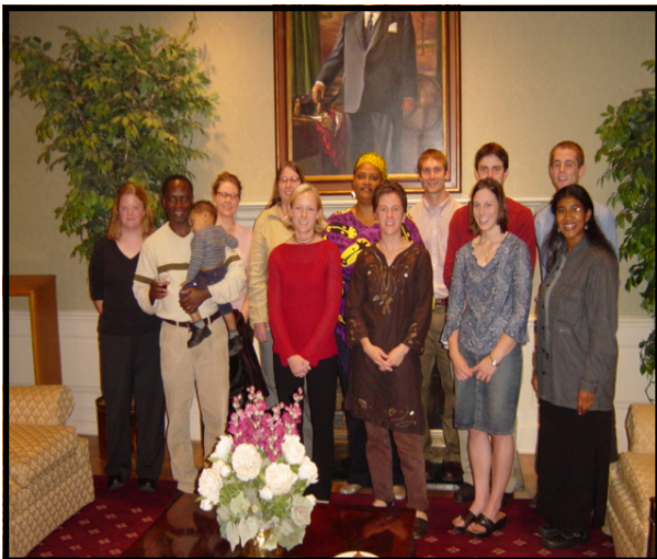
Academic Year FLAS recipients at the 2003 Fall reception