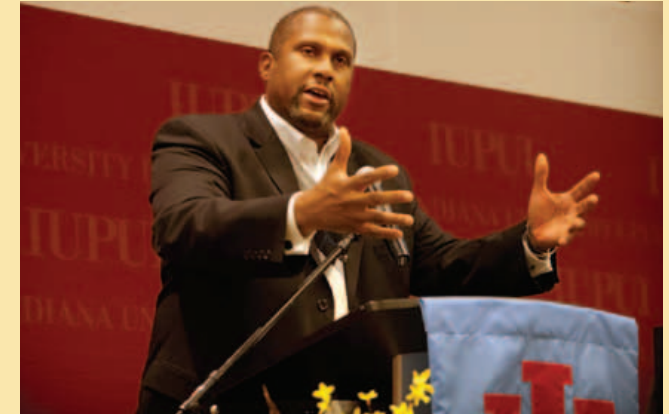
Tavis Smiley served as keynote speaker for the inaugural event.