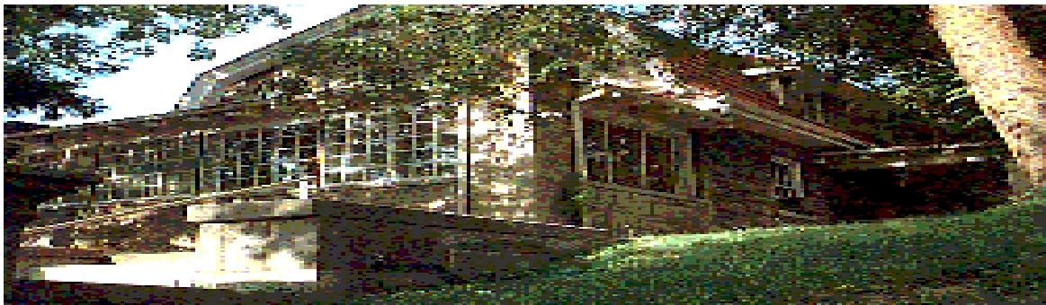
The American Indian Studies Research Institute 422 North Indiana Avenue, Bloomington, IN 47408

IU is a strategically appropriate location for AISRI because it has a long and preeminent history in American Indian studies and today has more campus-wide resources for the study of Indian people than perhaps any other university. Facilities and collections here include the Ohio Valley-Great Lakes Ethnohistorical Archives located in the Glen Black Lab of Archaeology, which has extensive archaeological collections and a library as well; the holdings of the Mathers Museum of World Cultures, which has unique collections of American Indian material objects and photographs; and the Archives of Traditional Music, which has one of the country's largest collections of wax cylinders documenting Indian languages and music from the early twentieth century, as well as the Archives of the Languages of the World that has the fieldnotes and sound recordings of past IU students in Anthropology and Linguistics who studied languages in the field. In addition to those resources, there are extensive collections of books, manuscripts and photographs in the Wells Library, the Lilly Library, the Mathers Museum, and the American Indian Studies Research Institute itself. In short, IU has massive holdings that are dispersed among many campus units and provide a treasure house of materials for IU faculty, students, and visiting scholars.