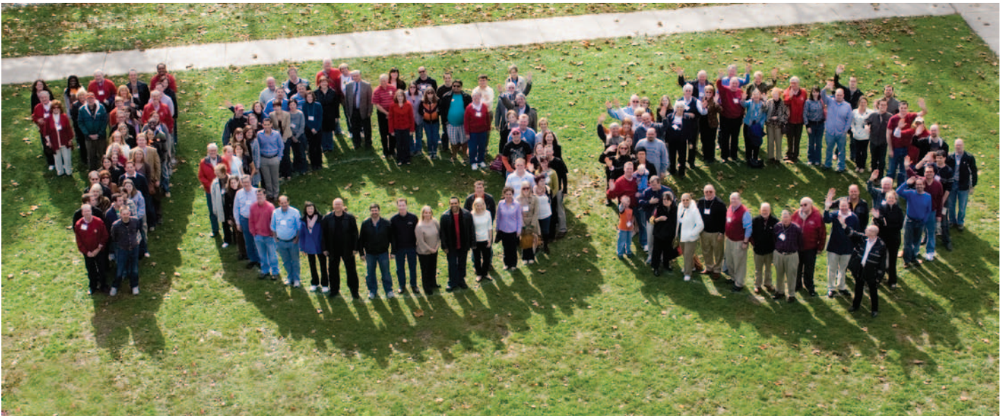
Everyone gathered in Dunn Meadow for the Centennial photo shoot.