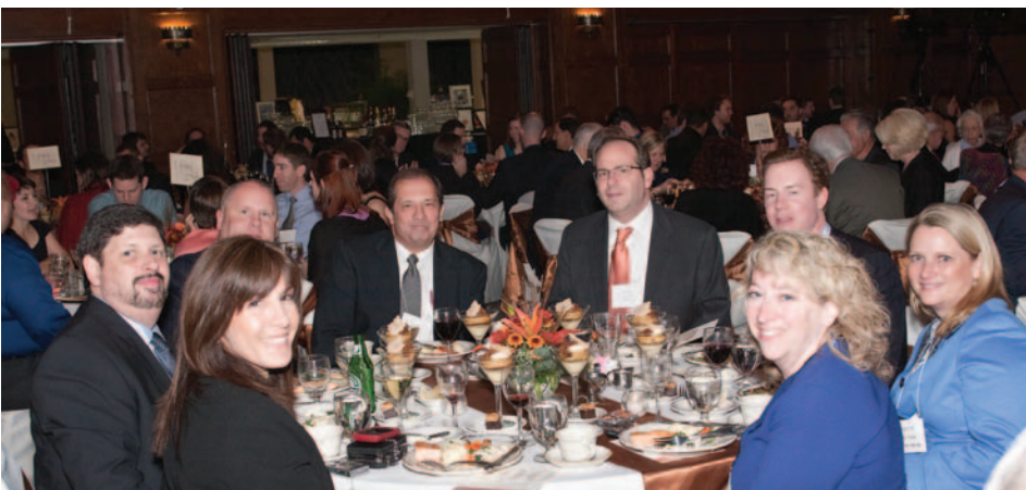
Alumni Hall Filled to capacity.