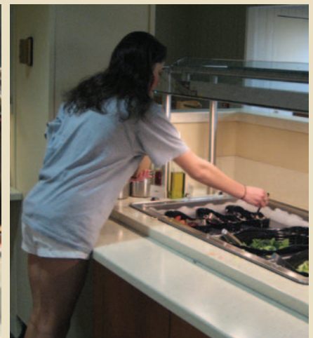
The changes at the Dunn Meadow Café above, are just part of a major redesign of all food services within the IMU.