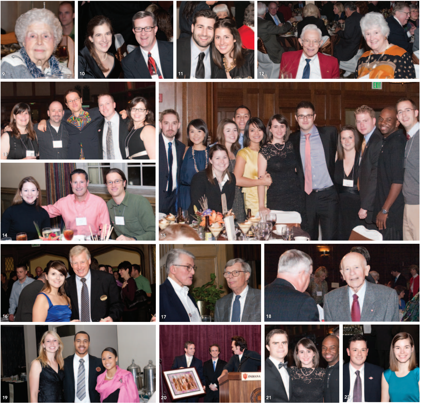
(Cover photos, top left to right)