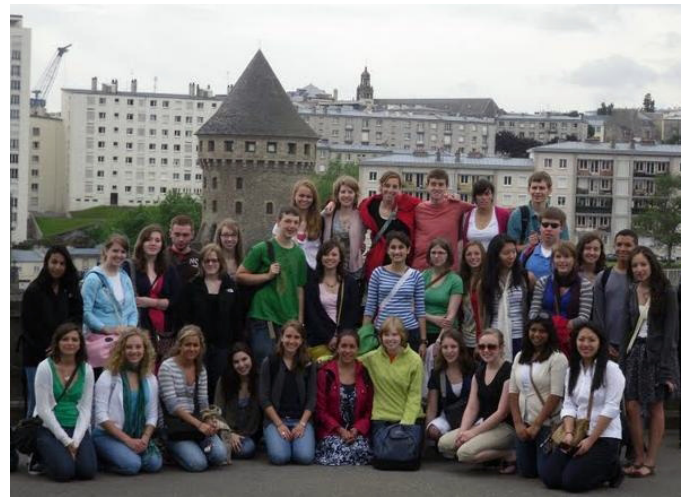
The 2009 Brest stagiaires stop for a group photo during a tour of their city.

After the first two weeks of classes, it was high time to discover other parts of Brittany. In order to satisfy the students' appetite, we explored the medieval village of Locronan, renowned for its delicious kouign amann , a cake that we obviously had to try. We continued our trip at La Pointe du Raz and ended our excursion in Quimper. A trip to France would not be complete without touring another beautiful region, Normandy. The first day started in the picturesque city of Dinan, and we then visited the fortified city of Saint-Malo and finally the Mont Saint-Michel. The second day of the trip was probably the most emotional of all as we spent it at the D-Day Beaches and at the World War II Memorial at Caen.