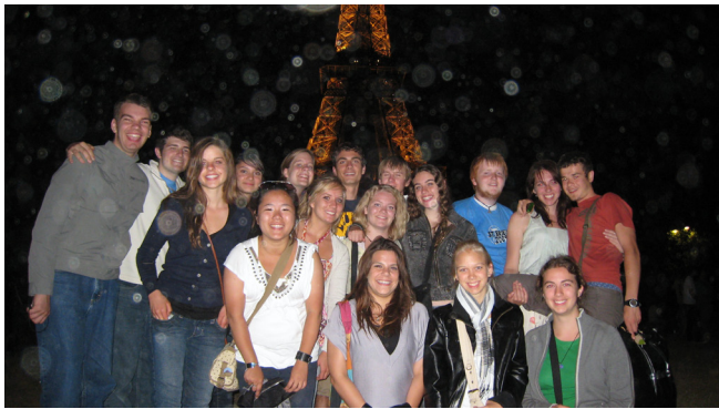
St. Brieuc students under the lights of the Eiffel Tower

Our school days were packed with classes, sports, theatre, and chorus, and at the end of nearly every week we visited the region’s most historic and picturesque sites – the winding streets of Dinan, the walled city of St. Malo, the ancient wonder of Mont St. Michel, the medieval fortress of La Latte, and always, always, the spectacular Breton coast. On the eve of the Fourth of July, we gathered on Omaha Beach to sing our national anthem, and in the final days of our program, we wore ourselves out exploring Paris top to bottom.