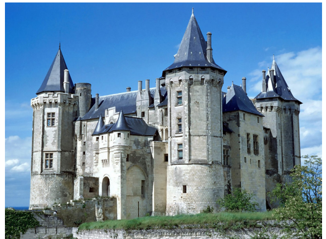
The Chateau in Saumur, built in the 12th century.

The IUHPFL French programs have become exceptionally selective in the past few years as the number of applicants has risen. For the summer of 2009, for example, 143 French students submitted applications for only 68 spots in the programs in Brest and St. Brieuç. By contrast, 204 Spanish students applied for 135 spots in the Spanish language programs. Although Spanish students consistently make up the highest number of applicants to the IUHPFL, French students have had tougher competition due to proportionately fewer spots. In order to keep pace with the high number of exceptional applicants and to keep class sizes small, the IUHPFL began its search for a third location in France last summer.