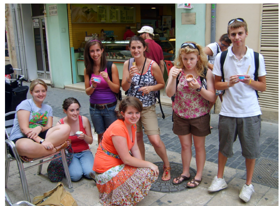
Valencia students know that eating ice cream is an integral part of studying Spanish

The Valencia program culminated with the fiesta de despedida when all the students shared their talents and enthusiasm in theatrics and song. The finale of our concert, which the students dedicated to their host families, accurately concluded the overall feeling and the theme of our Program in Valencia, that “Nada de esto fue un error.”