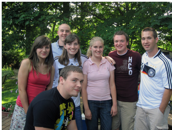
Krefeld alumni from the summer of 2008 met up recently for a cookout.