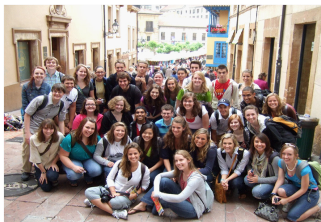
Super troupers and Broadway masters in Oviedo

We knew from the beginning that Oviedo was going to be different. From the first day we experienced its peculiarities—one student almost did not make it to the plane, another student lost his passport at Immigration Control in Madrid. So we knew it would be a different experience. But it turned out to be different in a wonderful way. Oviedo students were willing to make a difference and so they did. We learned about the astonishing history of Spain and the importance of Asturias as an origin of this country. We tried foods that we did not even know existed before coming here. We saw the impressive beauty of nature when mountains and sea share the same landscape. And we lived life as one more Spaniard in our families.