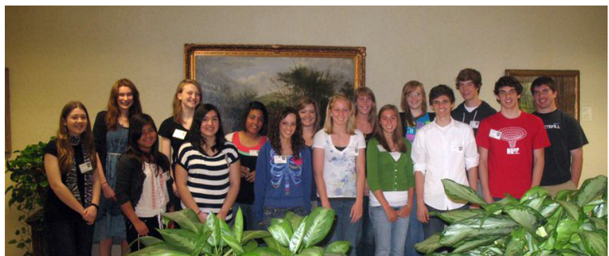
The inaugural group of IUHPFL students to visit Saumur, posing here for the camera at their orientation in May at the Indiana Memorial Union.