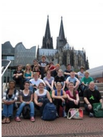
Krefeld students in front of the cathedral in Cologne.

This year the students visited Aachen, Berlin, and Cologne on their excursions, and enjoyed all the sights these cities have to offer. They also participated in “mini-excursions” within Krefeld. One special activity was visiting a German high school. The students accompanied a host sibling (or host cousin if they didn’t have a host sibling) for the day, and had the chance to experience the German school system first-hand by visiting several different classes. On another day, we went to the “Kresch-Theater,” which is the children’s and youth theater in Krefeld. There, the students (and teachers) could try out improvisation theater—and they did great! This was a really good sign that the students felt comfortable in German, and we absolutely had a lot of fun this afternoon!