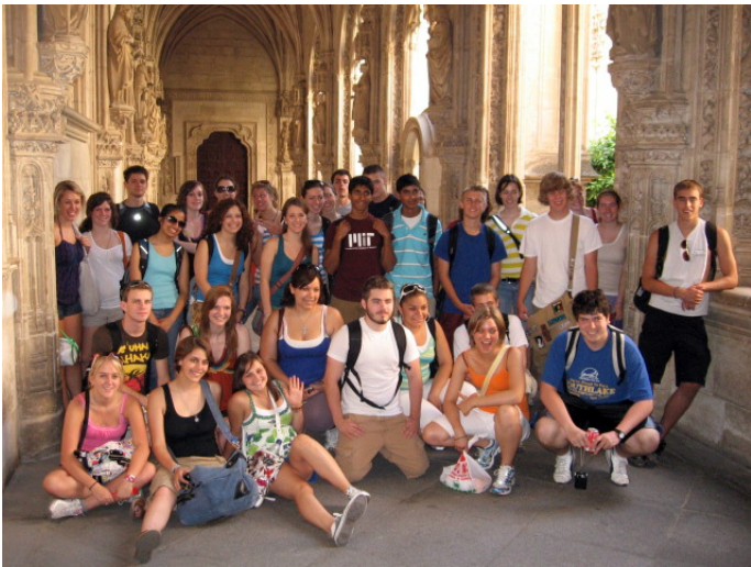
The Ciudad Real students in Toledo