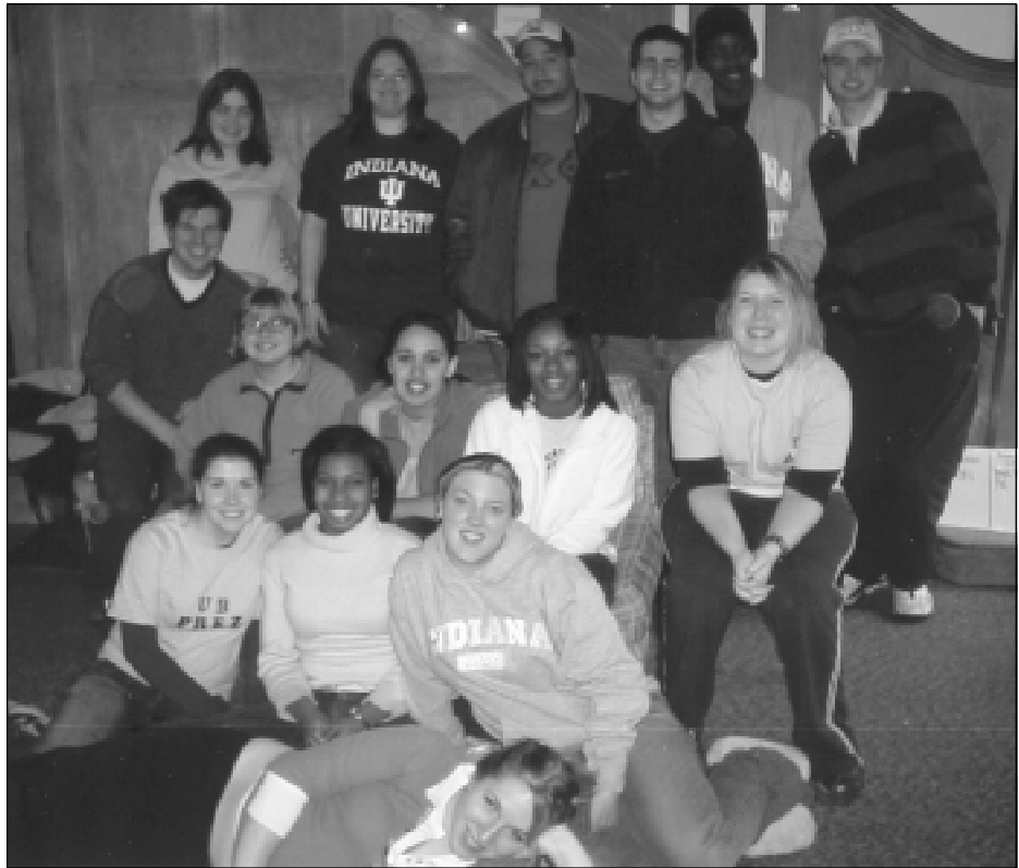
The newly elected/selected 2004 board gathers together at the annual John Malkin Leadership Retreat at Waycross Retreat Center.

in theater in London, where he now teaches drama at Kensington and Chelsea College. He can be reached at jmhahn@hotmail.com.