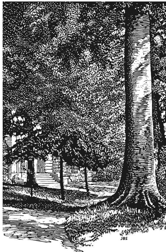
A Campus Beech