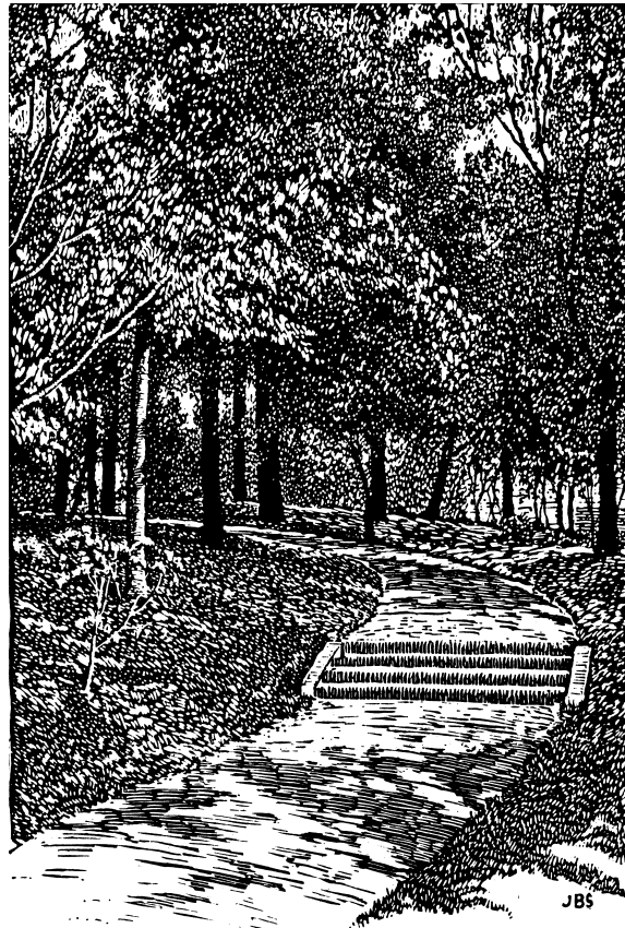
The Observatory Walk