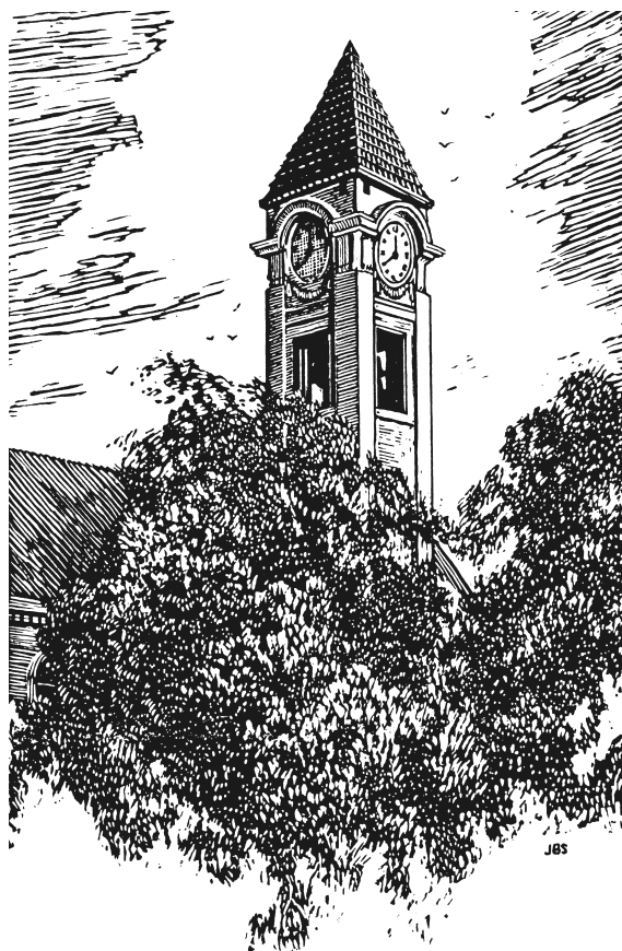
The Clock Tower