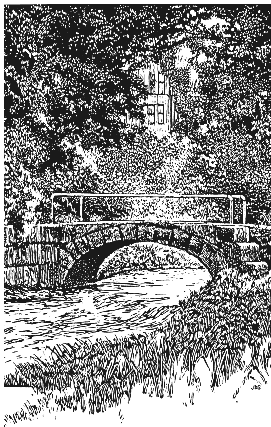
A Jordan River Bridge