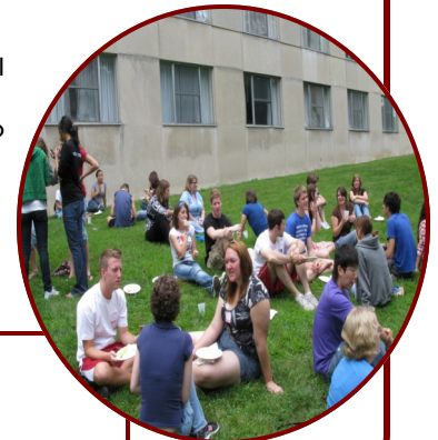
GVers interact with Foster International students at the GV/FIN picnic.

The Global Village is in good company here at IU. The other Living-Learning Centers on campus can offer both advice and companionship. We would do well to remember that, and to reach out to those in a similar position to our own. When it comes down to it, no LLC is an island. We exist in a rich environment. The potential for cross-LLC interaction is one of the many reasons to live in the Global Village.