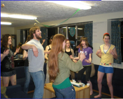
Students participating in Polynesian Culture Night learn the traditional greetings of the Ancient Hawaiian past.