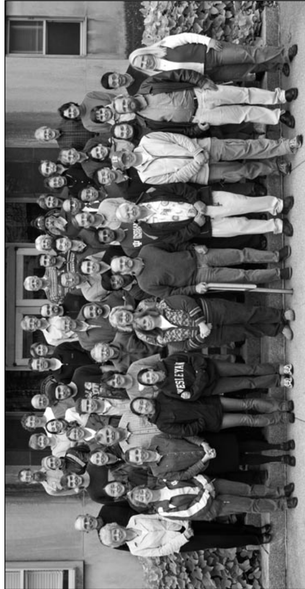
Geological sciences seniors, graduate students, faculty, staff — Fall 2004