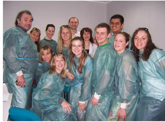
Russian and IU students and faculty at the Rostov Regional AIDS Center.

Anthropology is not the only REEI-affiliated unit where important work on regional health issues is taking place. For the last three summers, the Department of Slavic