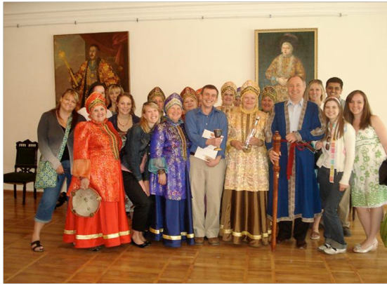
US-Russia Global-Health Care Course Study Program participants with the Starocherkask Cossack Choir.

Health and East Europe continued from page 4