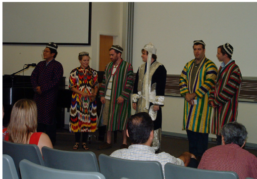
The SWSEEL Talent Show is an event in which participants utilize their newly acquired language skills in poetry readings, skits and musical performances at the conclusion of their summer study.