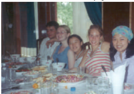
Enjoying the company of new friends