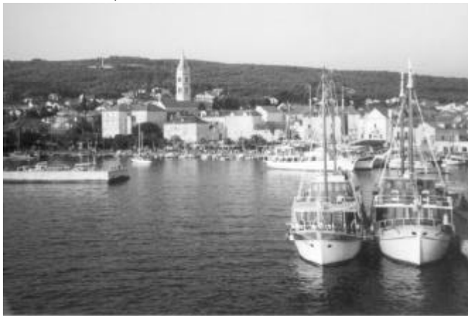
The island of Brač, Croatia

are still far below pre-war levels. For many it seems as if the crowds will never