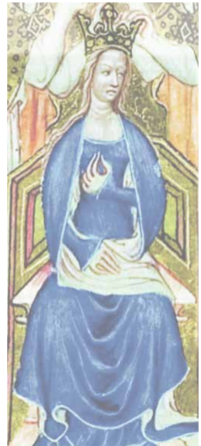
Anne of Bohemia

Our medieval film series on the Holy Grail was well attended, with students, faculty, and members of the community coming to see “The Fisher King” (1991), “Excalibur” (1981), and “Indiana Jones and the Last Crusade” (1989). Keep an eye on your inboxes in January, when we announce the theme and details on the slate of movies for the spring film series!