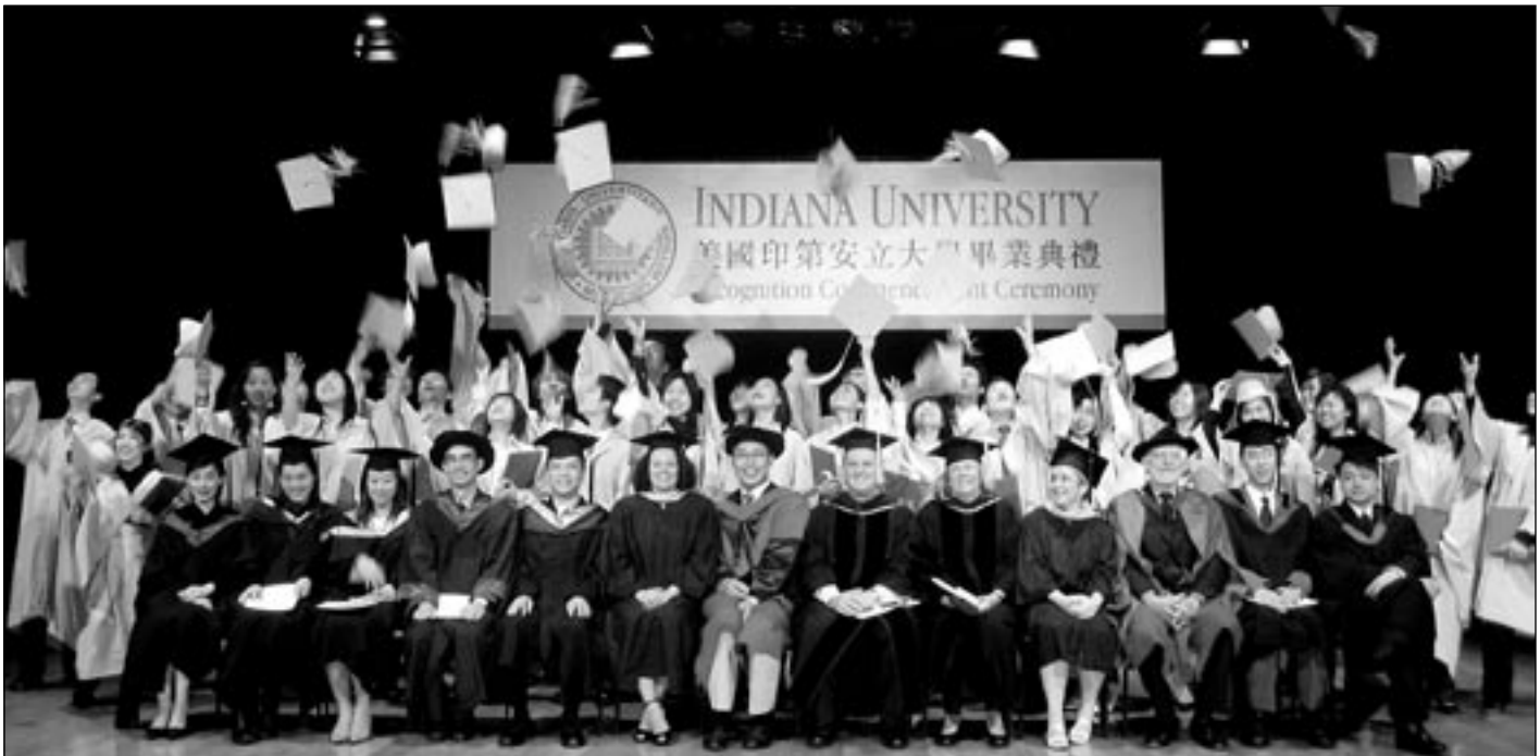
The first Hong Kong graduating class celebrates during a commencement recognition ceremony in China.