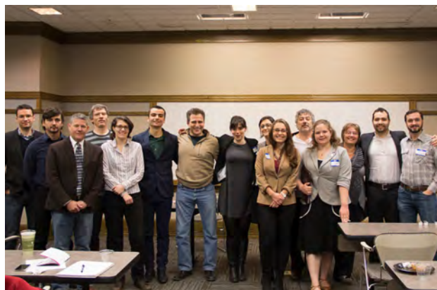
Participants in the 8th Annual Romanian Studies Conference.