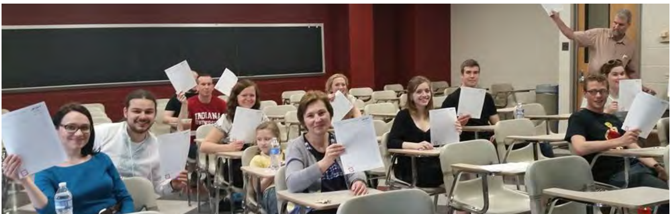
Happy participants at conclusion of the Total Dictation.

As the Olympiada drew to a close another important Russian-language contest was about to get under way in Ballantine Hall—“Total Dictation 2015” (Тотальный диктант), an annual international educational event in which native and non-native speakers all over the world test their knowledge of Russian spelling and punctuation by using pen and paper to reproduce a text written by a leading Russian author and dictated by a native speaker of Russian. Designed to stimulate and foster interest in the use of proper Russian as exemplified in the works of Russia’s most illustrious authors, past and present, the first Total Dictation, held in 2004 in the Russian city of Novosibirsk, drew approximately 200 people. Over the next decade the event grew in popularity, attracting more and more participants in and outside of Russia. In 2015, the Total Dictation counted over 100,000 participants in 549 cities of 58 different countries. Bloomington, Indiana figured