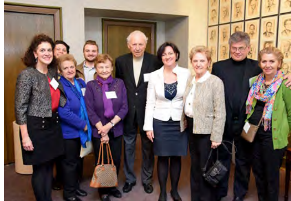
Participants in the 33rd György Ránki Hungarian Chair Conference