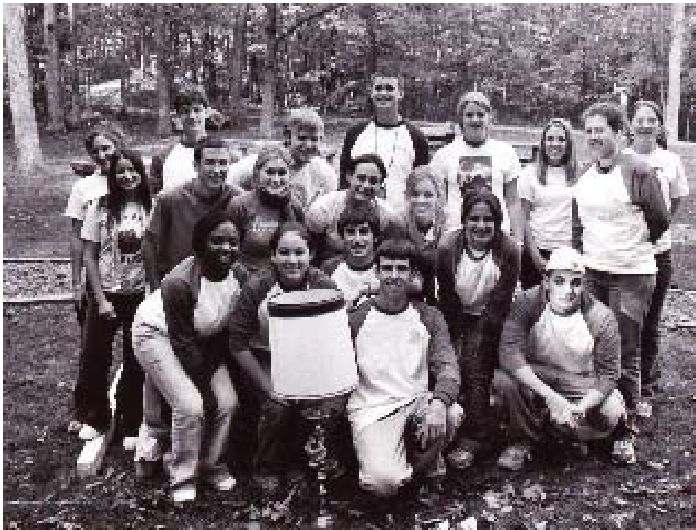
One Team of 2004 Retreat Participants

All sophomores are required to attend the LAMP retreat on Sunday, October 9. We know from the very positive response of previous sophomore classes that you will learn and enjoy as you work and play together in the wooded hills of Brown County.