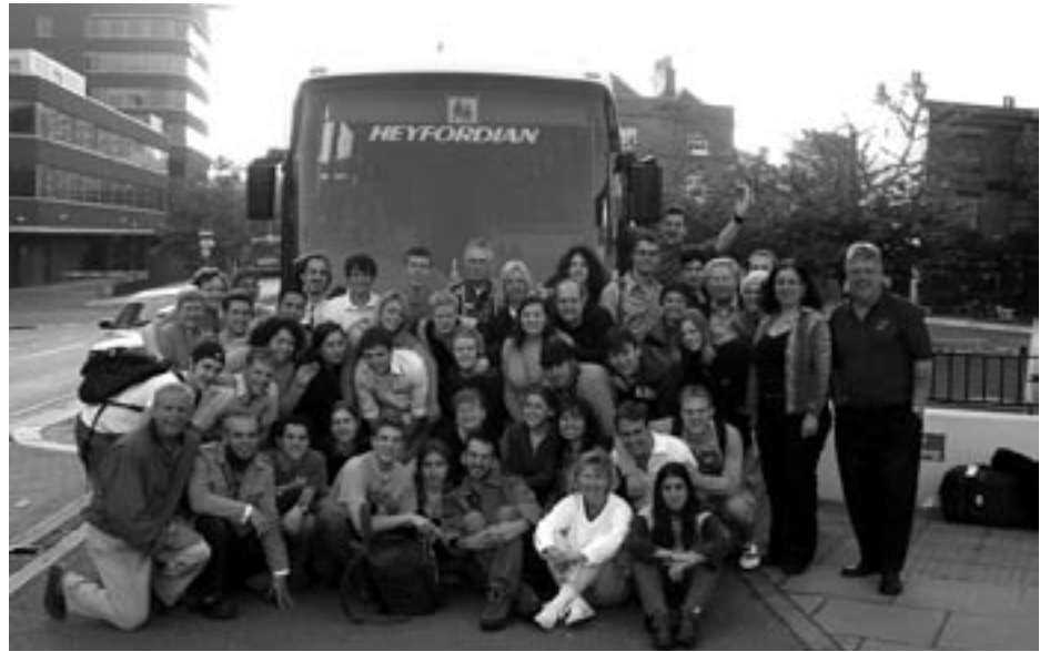
A group of 46 Singing Hoosiers, alumni, and relatives toured Wales and England last May.

This United Kingdom tour was especially pleasant for us because the "kids" generously accepted us as part of the group. During many sight-seeing tours (the Llechwedd Slate Caverns, Portmeirion Village, and several castles in Wales; and in England, the magnificent Warwick Castle, Stratford on Avon points of interest [Shakespeare's home and the Royal Shakespeare Theatre, just to mention two], and