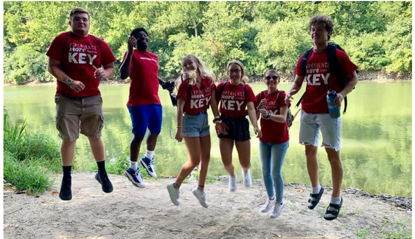
The KEY Summer Institute, which featured off-campus visits to museums and more, has started the work of elevating our students.