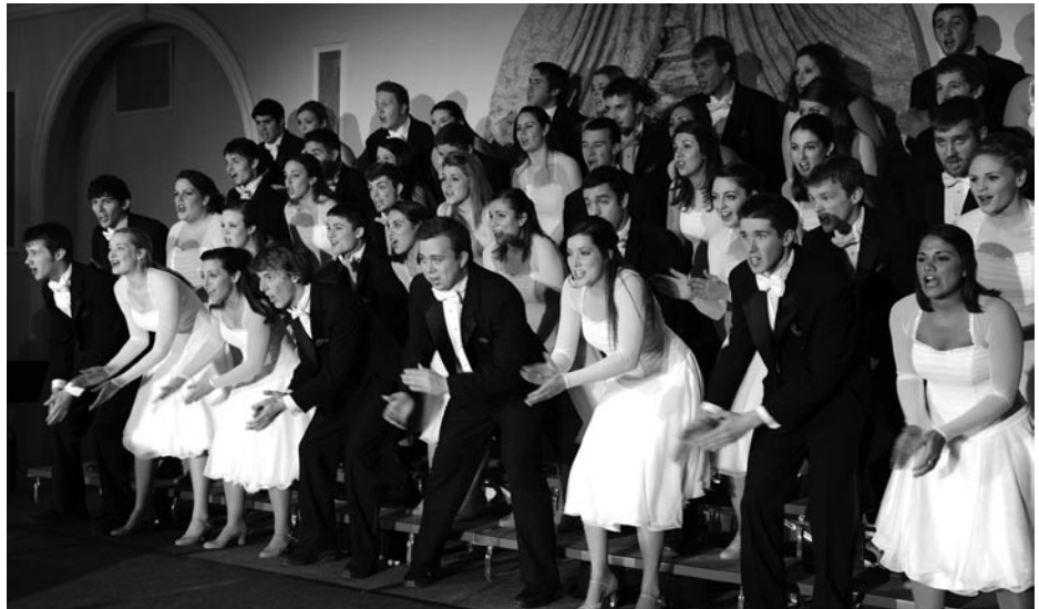
The ensemble entertains at the Indiana Society of Washington, D.C. Inaugural Ball.

words. To absorb the energy and mood of the millions in attendance for the Inauguration Day was, in itself, an event. In fact, I stood next to a woman whose grandmother was shot and killed by a police officer during the civil rights riots of the early 1960s. The stories and bonds of those also in attendance made the experience even more meaningful to us — born in the late 1980s and early 1990s, never having known such turmoil in our lifetimes.