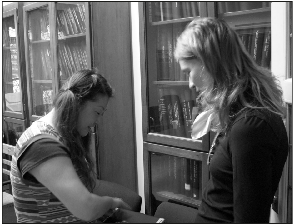
Students socializing with the departmental dissertations