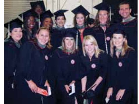
MPH Grads May 2010

We have also begun work on the courtyard expansion to the HPER building. It will include a new student advising center, a 178-seat auditorium, faculty offices, conference rooms, and future laboratory space.