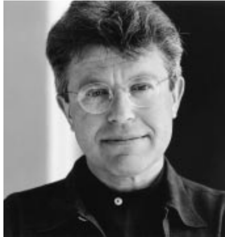
Daniel Libeskind Toronto; and the Military Museum in Dresden. He is also designing the sets for Wagner's "Ring" for Covent Garden in London.

His museum for the city of Osnabrück, Germany, the Felix Nussbaum Museum, opened in July 1998, followed by the Imperial War Museum North in Manchester, in 2002. He is presently designing the Spiral Extension to the Victoria and Albert Museum, London; "Westside," an urban scale entertainment and shopping center in Brünen, Switzerland; Maurice Wohl Convention Centre, Bar Ilan University, Tel Aviv; Atelier Weil, a private atelier/gallery in Mallorca, Spain; the extension to the Denver Art Museum; the Danish Jewish Museum in Copenhagen; a Post-Graduate Centre at London Metropolitan University; the extension to the Royal Ontario Museum in