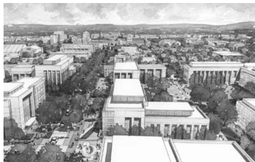
Master plan, SmithGroup/JJR

In terms of enrollment, the plans assume IUB will stay stable at about 40,000