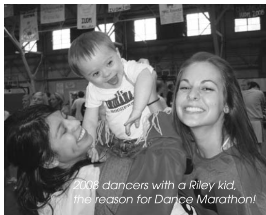
2008 dancers with a Riley kid, the reason for Dance Marathon!

The 19th annual Dance Marathon, is Nov. 13–15! With help from students, parents, and the local community, last year's annual donation to Riley Hospital for Children was $1,376,550.23! Look for a special feature coming soon in the Indiana Alumni Magazine .