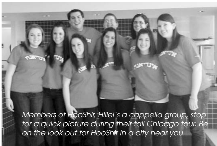
Members of HooShir, Hillel's a cappella group, stop for a quick picture during their fall Chicago tour. Be on the look out for HooShir in a city near you.