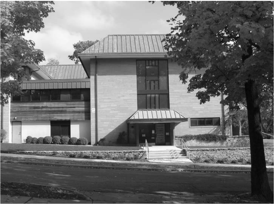
School of Informatics, IUB