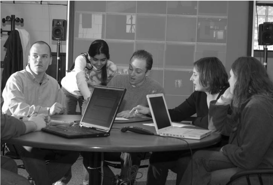
Informatics students are problem-solvers and team players.