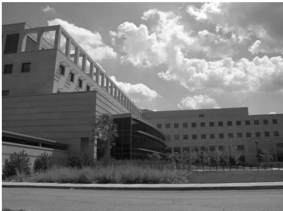
Informatics and Communications Technology Complex, IUPUI

INDIANA UNIVERSITY BULLETIN OFFICIAL SERIES (USPS 262440) ISSN 0-888-5338