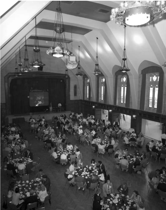
Reception for the 2005 graduating students.

University Electives (23 cr.) 12 of the 23 credit hours must be completed at the 300 level or above.