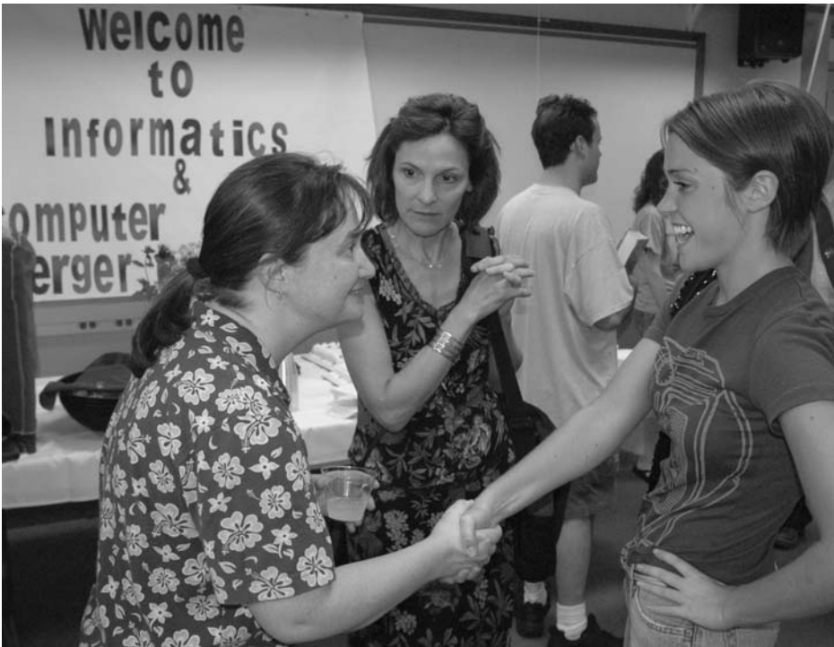
In July of 2005 the Department of Computer Science merged with the School of Informatics.

Research and theory in informatics move rapidly to application and development. The faculty teaching in the School of Informatics participate in research activities and new applications of technology. As a result, faculty can transmit state-of-the-art knowledge to their students. Indiana University is capitalizing on this great research strength in informatics at both IUB and IUPUI with the formation of the Informatics Research Institute (IRI). The IRI conducts research in areas of emphases shared with the School of Informatics, including fundamental research in human-computer interaction; fundamental research in capturing, managing, analyzing, and explaining information and making it available for its myriad uses; and expanding research into policy and socioeconomic issues arising from information technology.