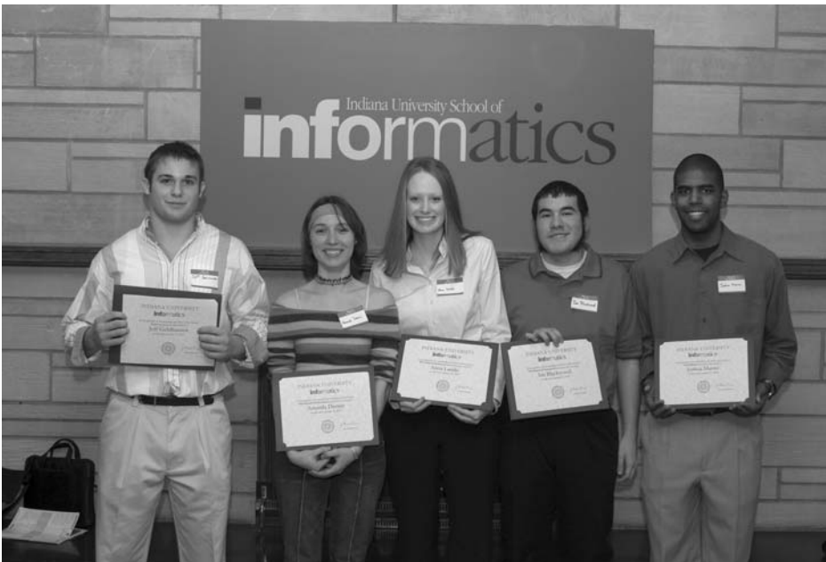
Undergraduate students are honored with scholarships to further their informatics studies.

Based on superior performance and in accordance with Indiana University–Purdue University Indianapolis policies, the program faculty will recommend that qualified students be awarded degrees with distinction.