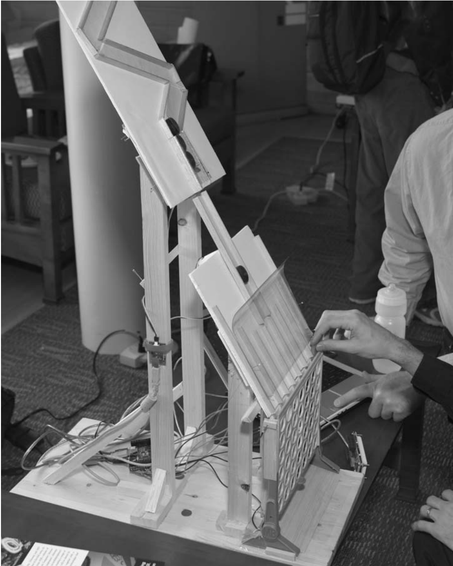
Informatics seniors participate in capstone projects, working with community businesses to gain real-world experience.

Intermediate animation course developing high-end simulation productions. Applying construction/rendering techniques and applying physics and dynamics, students will produce a 3-D animated narrative. Other topics include advanced character modeling, camera movement, backgrounds, textures, and lighting. [Animation program: Maya]